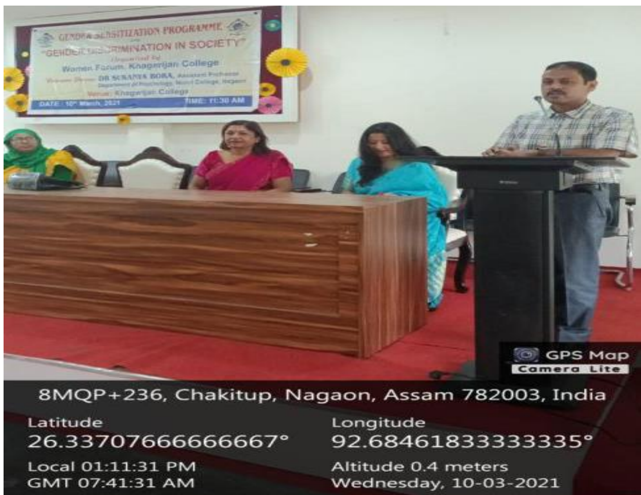
Figure 1: Inaugural Speech by the Principal of the College on the Gender Sensitization Programme