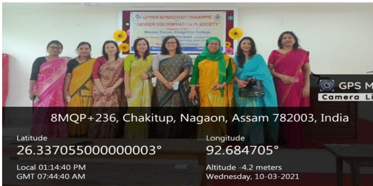
Figure 2: Screen Shot of the Gender Sensitization Programme