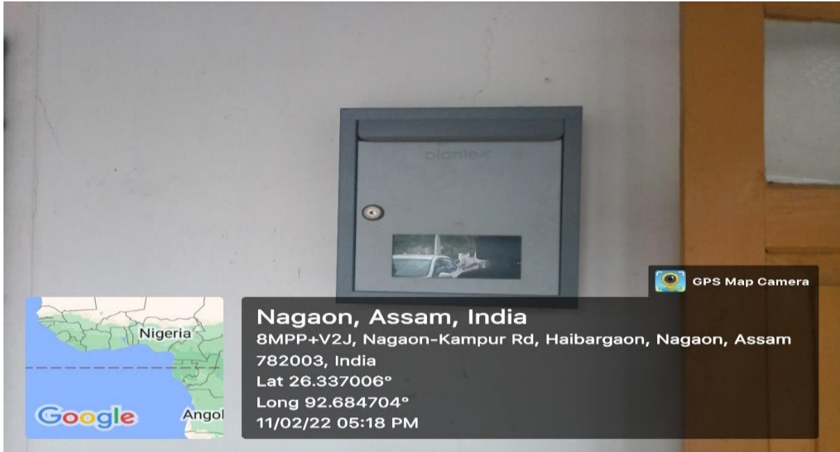
Figure 1: Grievance Box