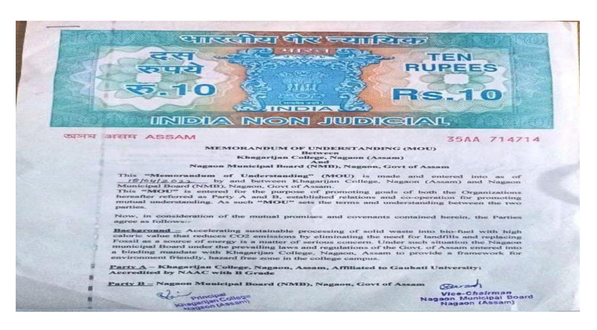
Figure 3. MOU with Nagaon Municipal Board