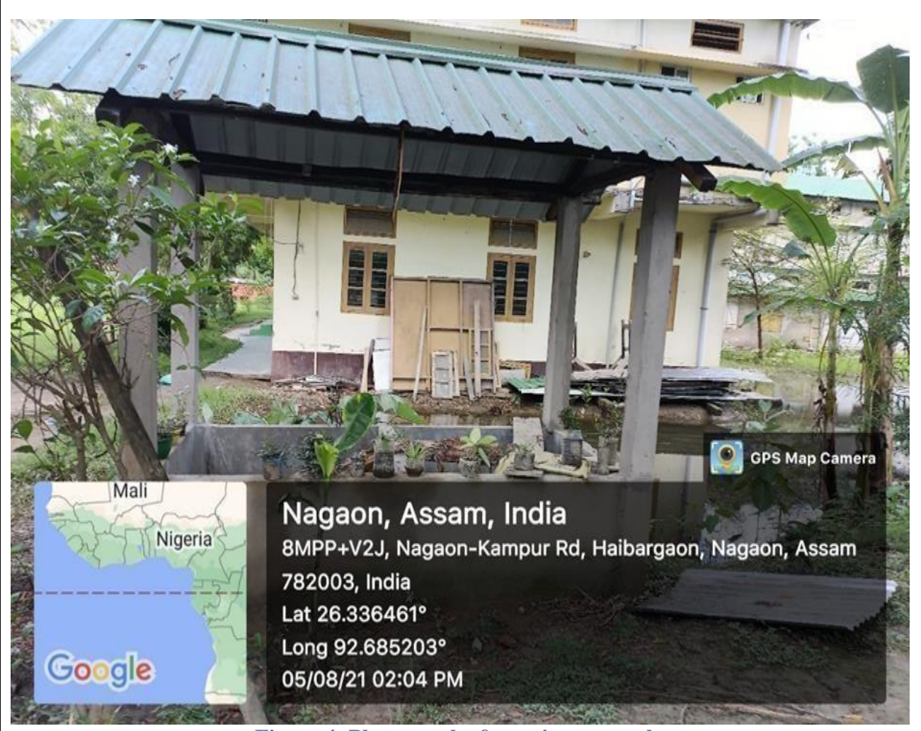
Figure 4: Photograph of vermicompost plant