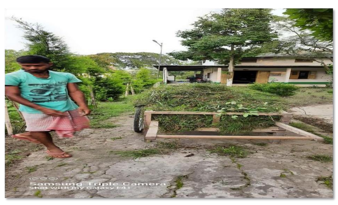
Figure 2. Photographs of cleaning the campus